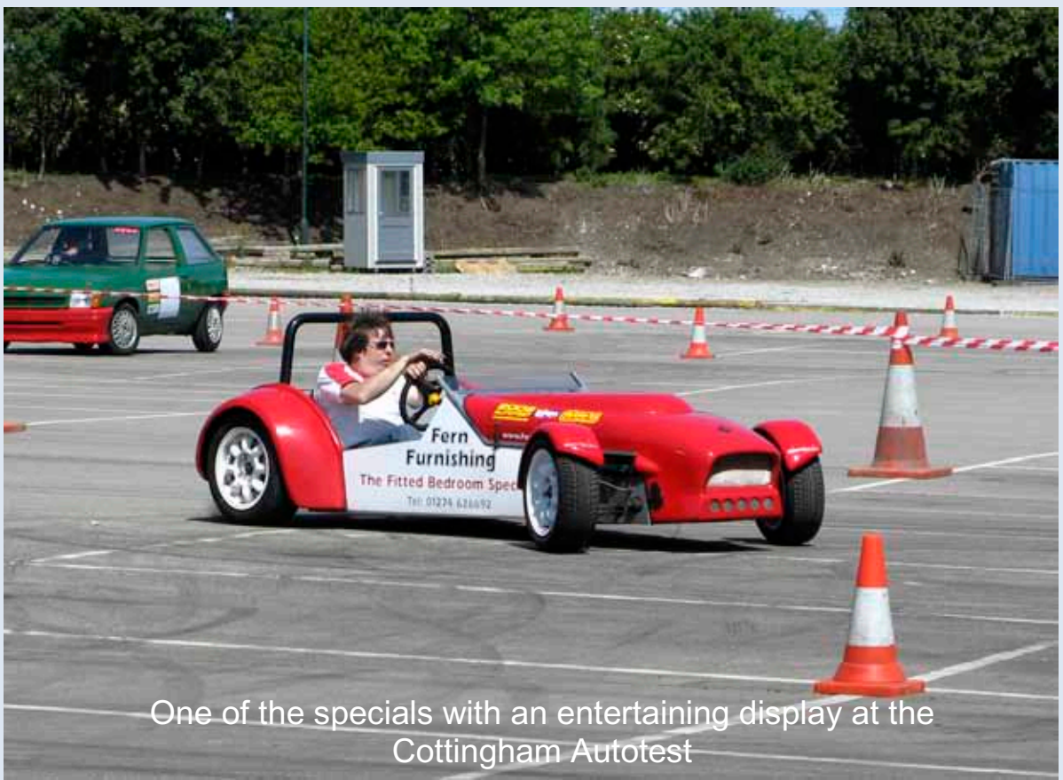
One of the specials with an entertaining display at the Cottingham Autotest