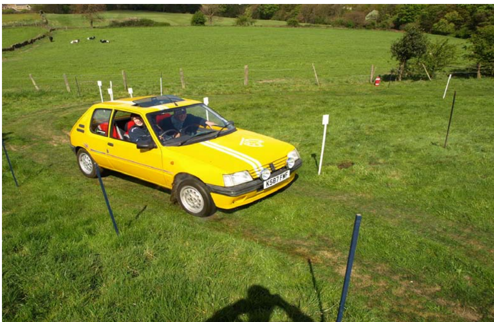
Chris & Tom tackle Test 1