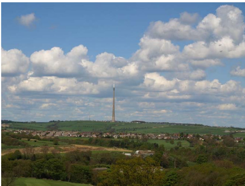
The view from the start of Test 1