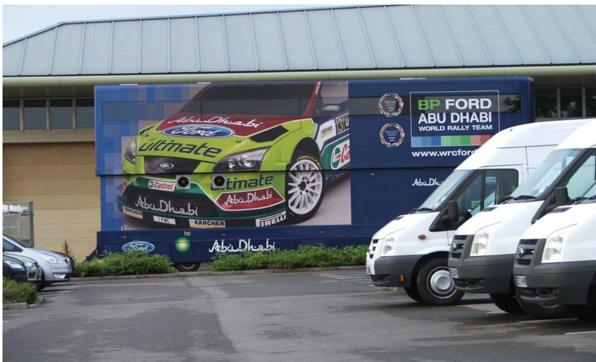
This was one of the service trailers spotted in the car park.