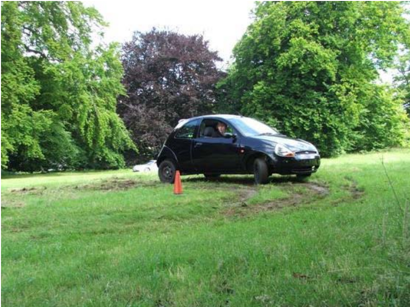
Ken & Joe Sturdy's new autotest vehicle on the Sledmere autotest a closer examination reveals aerodynamic modifications to the bonnet.