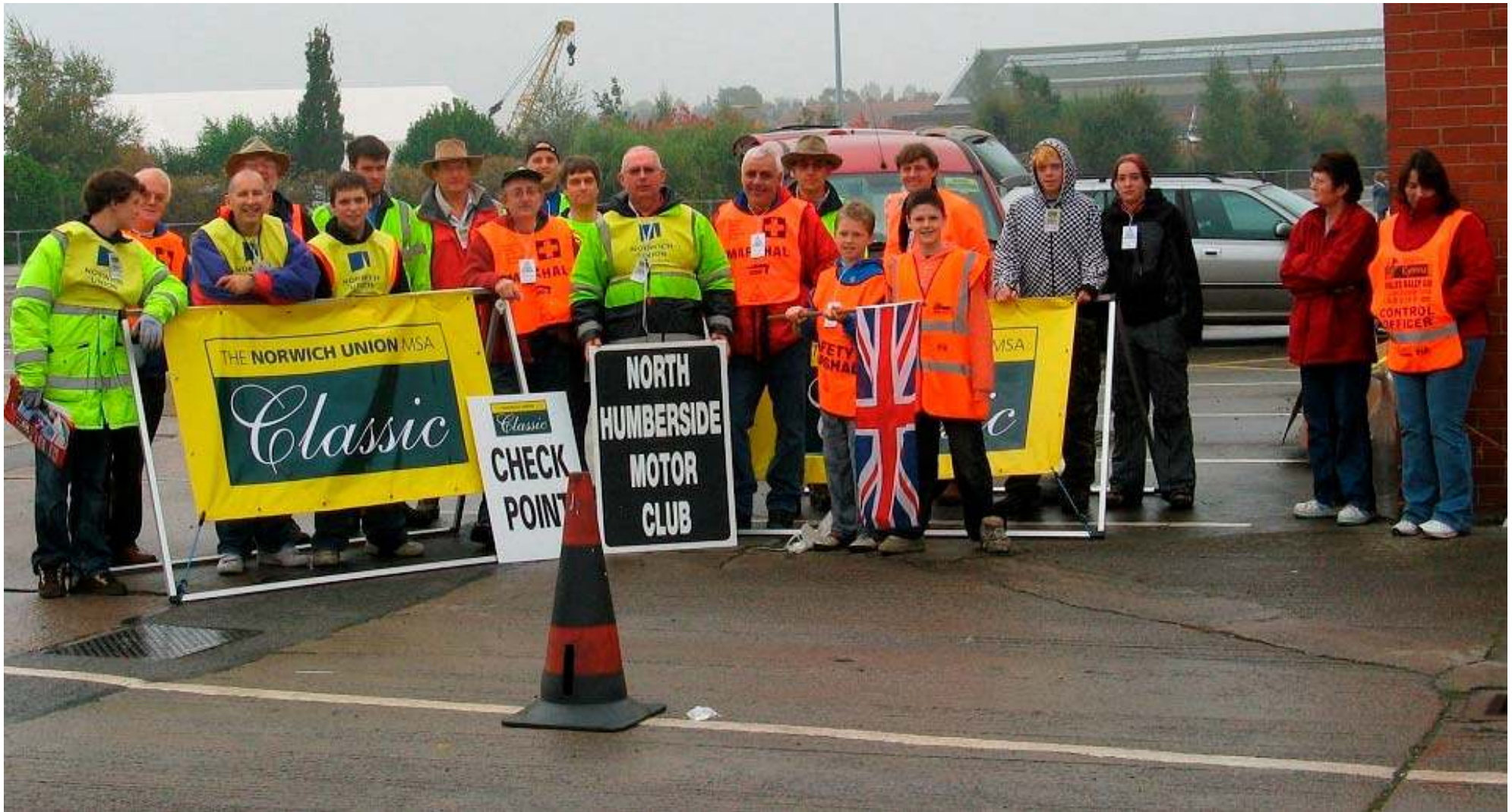
The Marshalling team at York Railway Museum on the Norwich Union Classic

Digital colour copying sponsored by IT@SPECTRUM