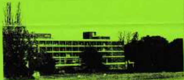
THE HUMBER ROYAL HOTEL